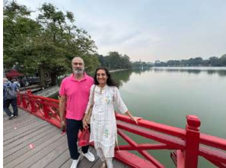
Ngoc Son Temple