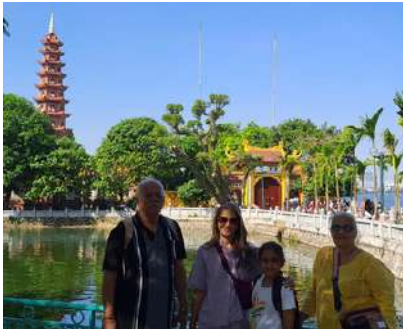
Tran Quoc Buddhist Pagoda

Distance Noi Bai Airport – Hanoi Central: 35km -> 45 minute transfer