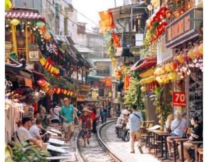
Train Street Coffee