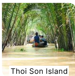
Thoi Son Island